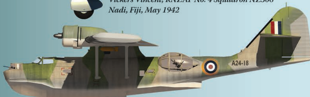
Consolidated PBY-5 Catalina, RAAF No. 20 Squadron A24-18 Shot down south-west Bougainville, 4 May 1942