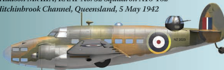
Lockheed Hudson Mk IIIA, RNZAF No. 4 Squadron NZ2023 Nausori, Fiji, May 1942