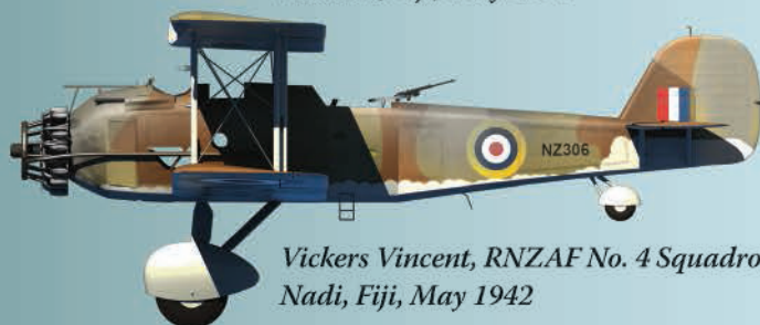
Vickers Vincent, RNZAF No. 4 Squadron NZ306 Nadi, Fiji, May 1942